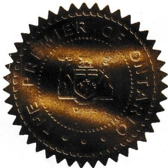
Doug Ford Premier

A handwritten signature in black ink, appearing to read 'Doug Ford'.