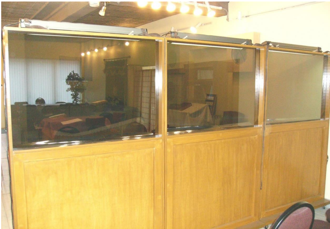
Ohev Yisroel – interior view from the Ezras Nashim