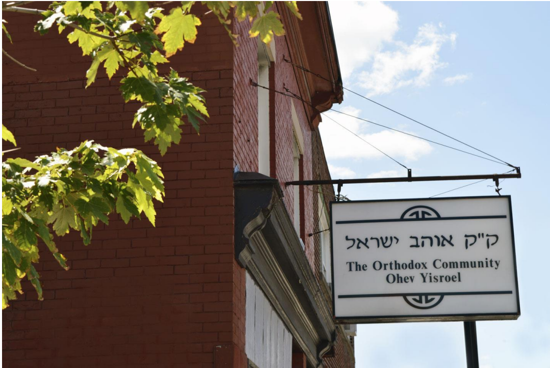
Ohev Yisroel – Exterior